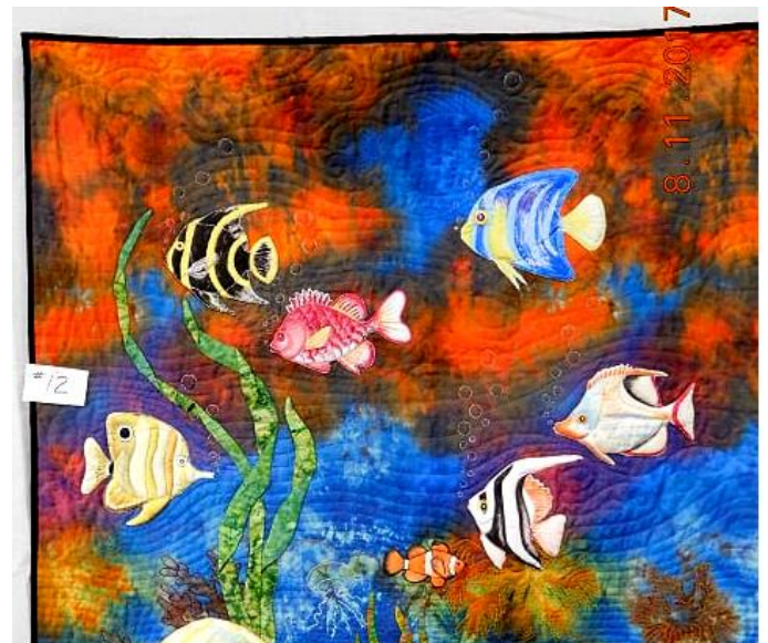
More of the quilts entered into the Farm, Home and Youth Fair.